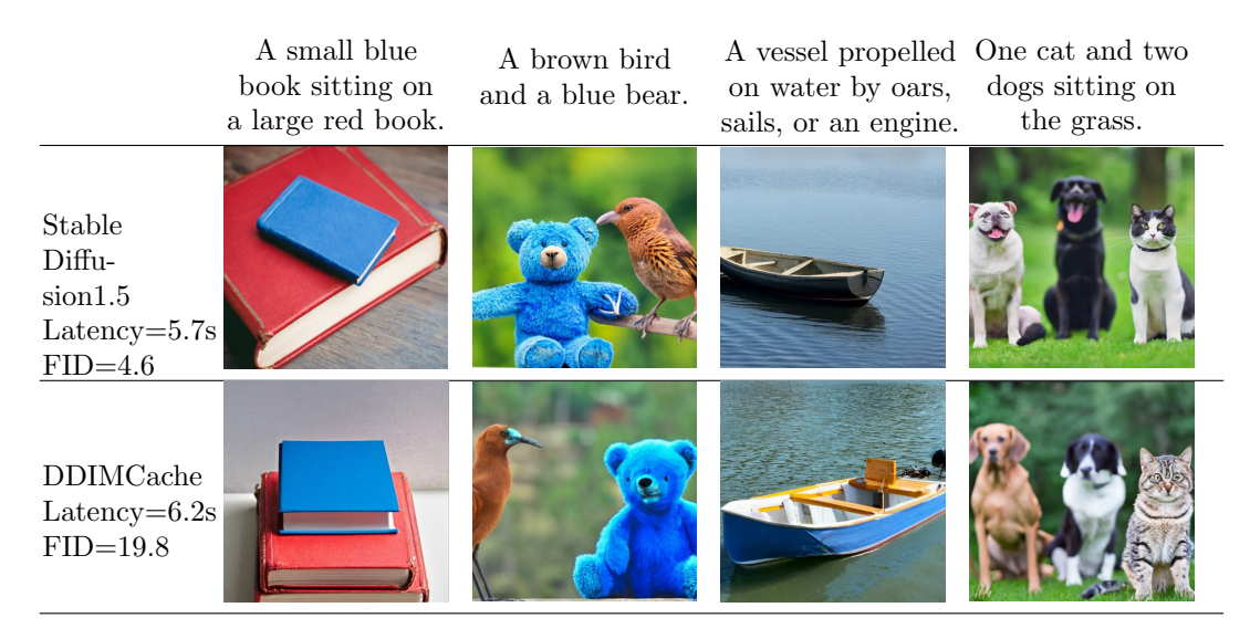
Tab. 4. Comparison of Stable Diffusion and DDIMCache on Image Generation.

1. Real-time image generation on mobile devices