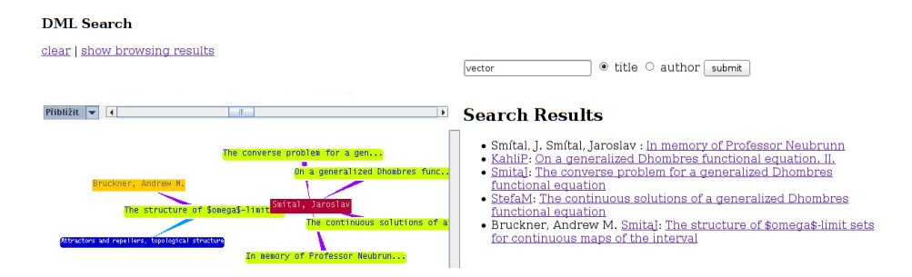
Fig. 1. Visual and textual interfaces to search results within DML-CZ. It allows users to choose how they browse the results. For this purpose, it is necessary that the interfaces are able to communicate.

We expect users to type (part of) a name or title in the search box. Then users can browse either the more familiar textual interface (as they are used to), or the visual one. Conversely, when viewing a particular subgraph in the Visual Browser, users can click to have it appear it in the textual interface as seen in Figure 1.